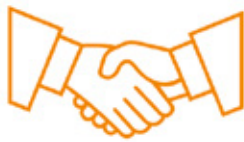
BLUE-CHIP CLIENT LIST