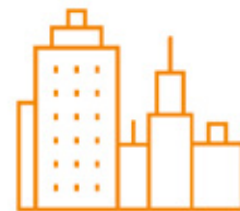
CUSTOMISED SERVICE OFFERING