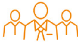
HIGHLY EXPERIENCED TEAM