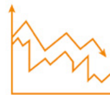
ROBUST BALANCE SHEET