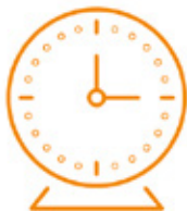
INDUSTRY LEADING SOLUTIONS